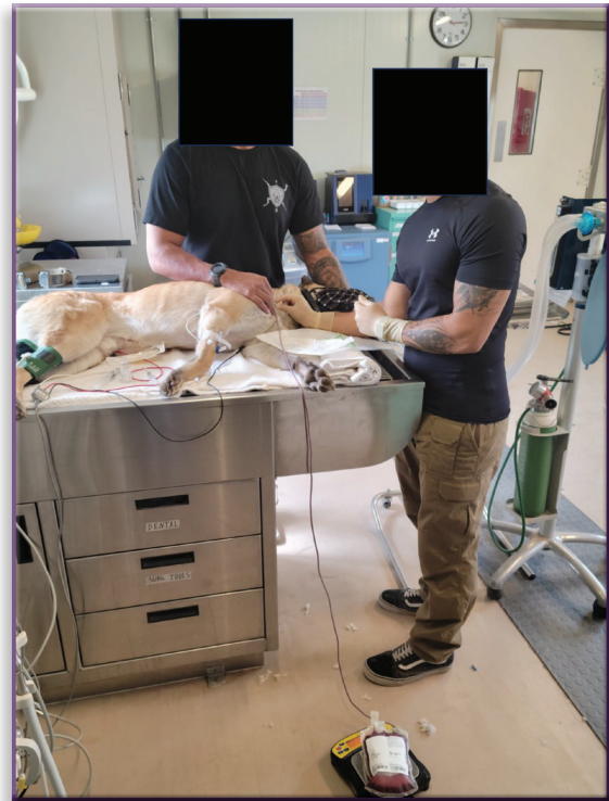
FIGURE 1 Collection of military working dog whole blood unit.

via aseptic jugular venipuncture using standard sterile techniques. Midazolam and ketamine are used for additional sedation if necessary. Dexmedetomidine may cause decreased mean arterial pressure and therefore it is avoided if possible. Acepromazine is also contraindicated because of a potential transient reduction in platelet count and function. If signs of hypovolemia or hypotension present following collection, administration of an isotonic crystalloid through a peripheral intravenous catheter is indicated to replace lost volume. Bland treats and a bowl of water are offered once the donor has recovered from sedation. 8 The collection of canine blood is almost identical to that of human blood. The principles, storage, and equipment used are identical. The main difference lies in the donor as many dogs must be sedated for the procedure.