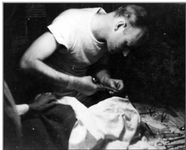
Figure 5: A Detachment 101 surgeon works on wounded in an austere environment during World War II.

Expedited evacuation has become the norm in OIF, but exists as a double edged sword. Timely evacuation mitigates the environmental effects of prolonged