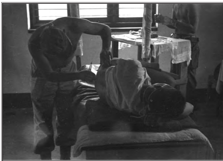
Figure 3: An OSS doctor conducts minor surgery in China circa 1944.

Damage control resuscitation guidelines are specifically focused on the prevention of the “lethal triad” consisting of hypothermia, coagulopathy, and acidosis; all of which can be either mutually supporting or mutually destructive (see Figure 2). The factors of the lethal triad are all proven independent and codependent indicators of mortality which also apply to DCS. Damage control resuscitation guidelines also include aggressive hypotensive and hemostatic resuscitation while providing parameters for addressing all three areas of the lethal triad. Ensuring that these efforts are proactive and continuous from the point of injury provides the most efficient care possible and uses a more scientific and therapeutic approach to combat trauma for SOF medics. Again, the medics care can and should potentiate success in supporting both TCCC and DCS in the hospital.